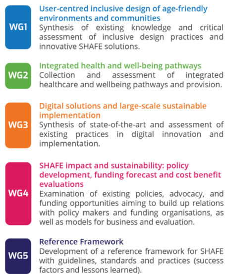
Fig. 2. NET4-Age-Friendly Working Groups