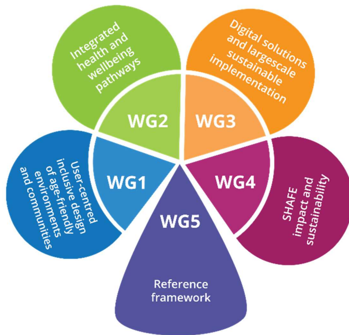
Figure 2. Working Groups CA 19136 NET4Age-Friendly