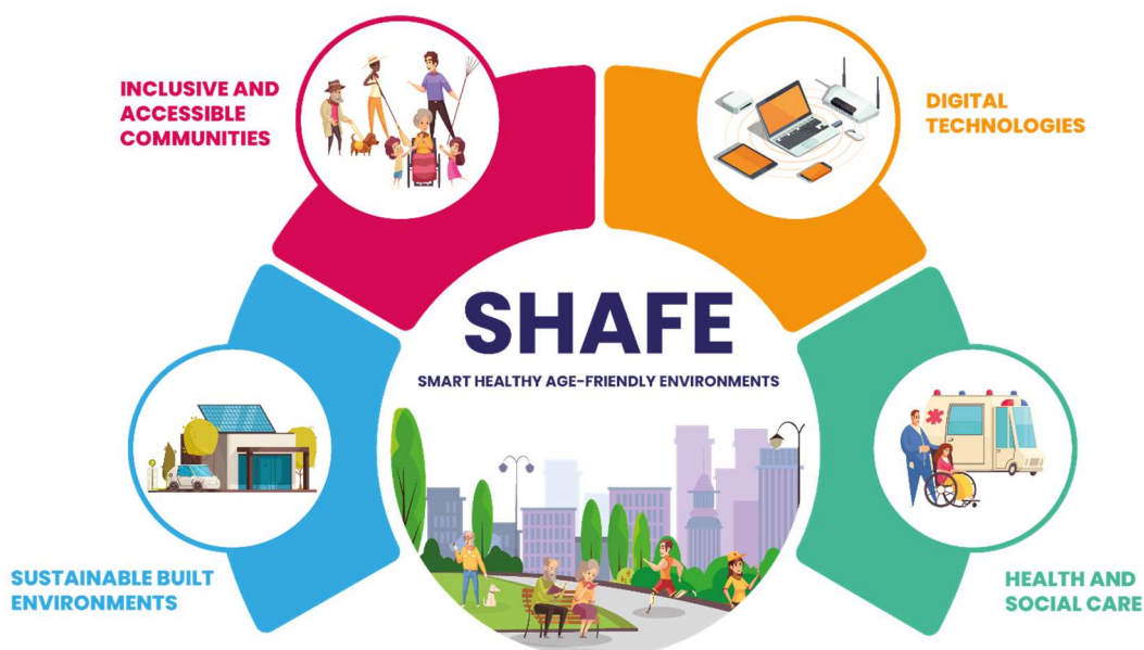
Figure 1. The SHAFE concept

In 2022, the United Nations, Department of Economic and Social Affairs, Sustainable Development, acknowledged SHAFE and the COST Action NET4Age-Friendly as a good practice.[2]